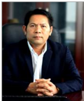
Chief Executive Officer of SVN (CEO)