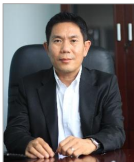
Chief Operating Officer of SVN (COO)