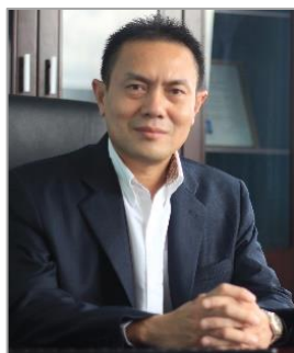
Chief Financial Officer of SVN (CFO)