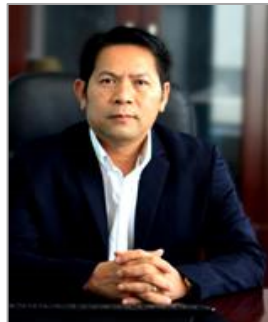
Chief Executive Officer of SVN (CEO)