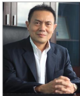
Chief Financial Officer of SVN (CFO)