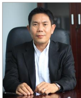
Chief Operating Officer of SVN (COO)