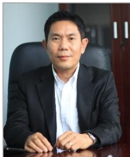
Chief Operating Officer of SVN (COO)