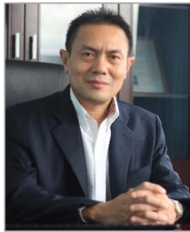
Chief Financial Officer of SVN (CFO)