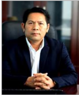
Chief Executive Officer of SVN (CEO)