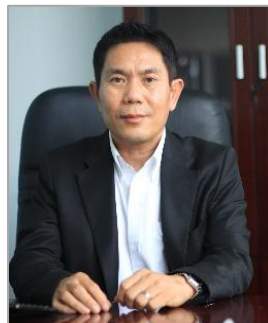
Chief Operating Officer of SVN (COO)