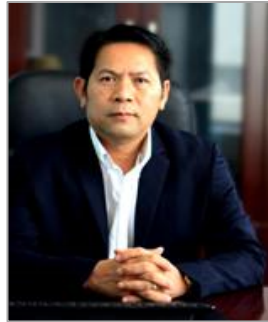
Chief Executive Officer of SVN (CEO)