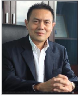
Chief Financial Officer of SVN (CFO)